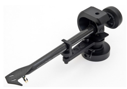
carbon fibre tonearm: Non-resonant tube with low friction bearings