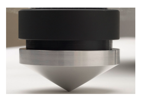
conical decoupling feet