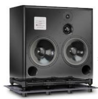
Soffit Mounted Studio Monitors