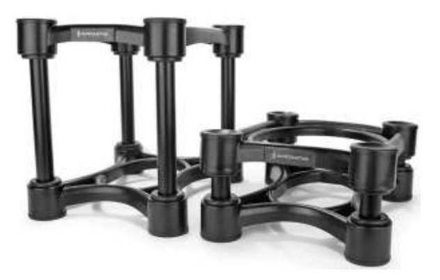
ISO-200 70 lbs / Pair