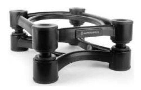
ISO-200 SUB 70 lbs / Single