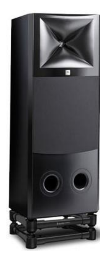
Isolation Stands For Large Studio Monitors