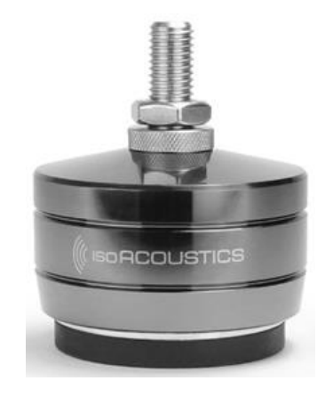
RHEA 420 lbs / Pack (Pack of 4)