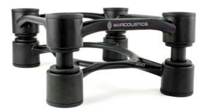
APERTA 200 75 lbs / Pair