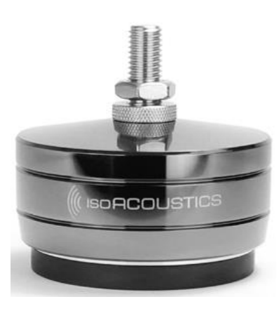
CHRONOS 620 lbs / Pack (Pack of 4)