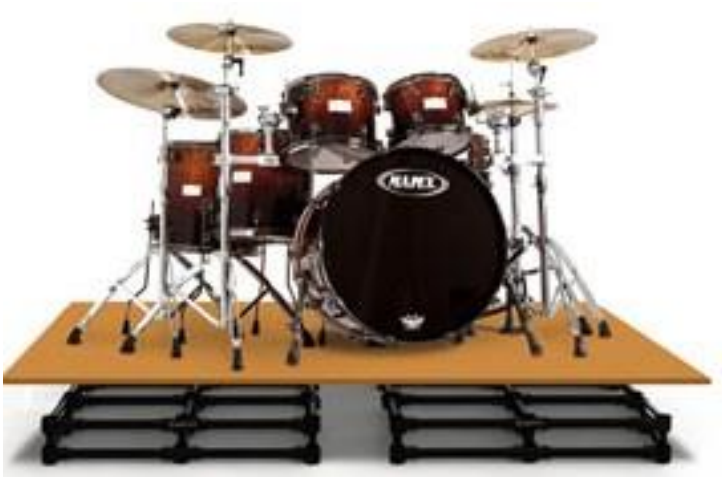
Isolation Stands For Drum Risers