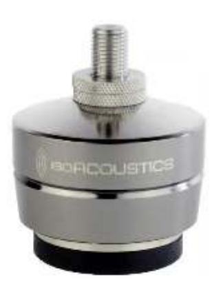
GAIA-I 220 lbs / Pack (Pack of 4)