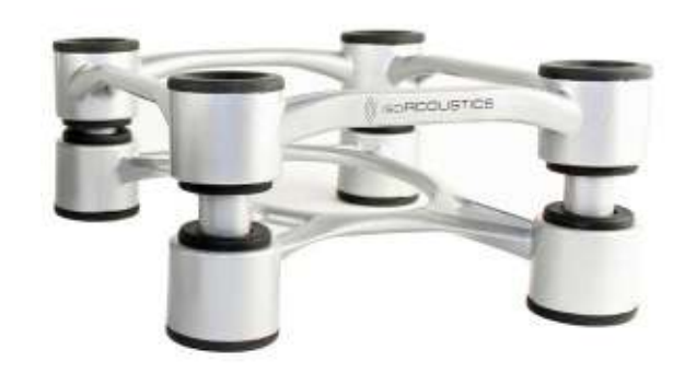
APERTA 35 lbs / Pair