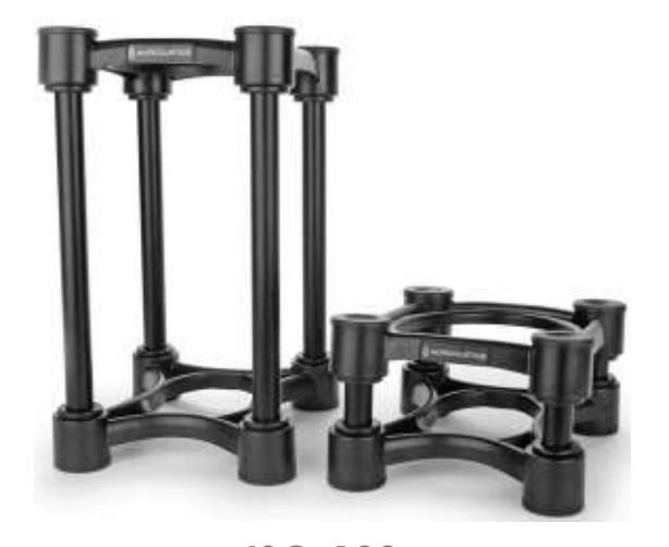
ISO-130 20 lbs / Pair