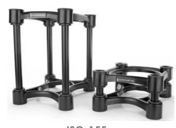
ISO-155 40 lbs / Pair