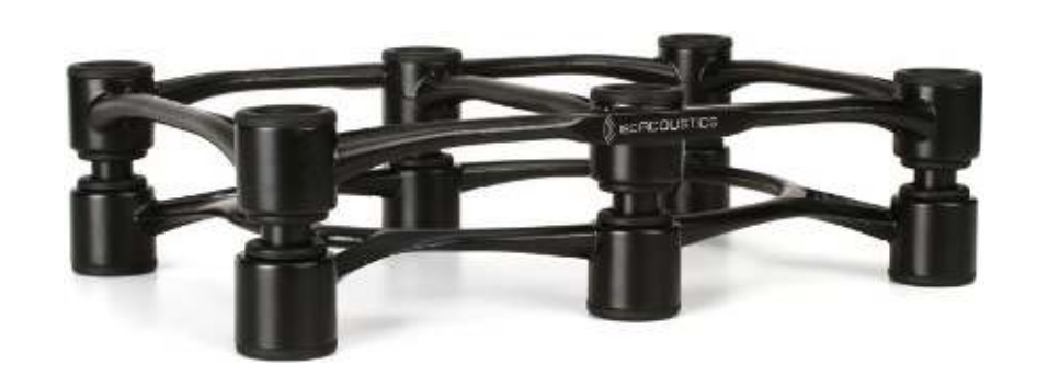
APERTA 300 60 lbs / Single