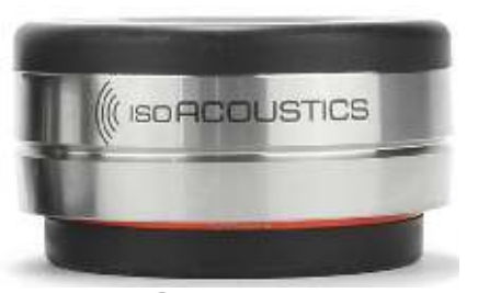
BORDEAUX 32 lbs each (Single)