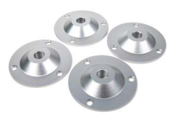
B&W ADAPTER PLATES