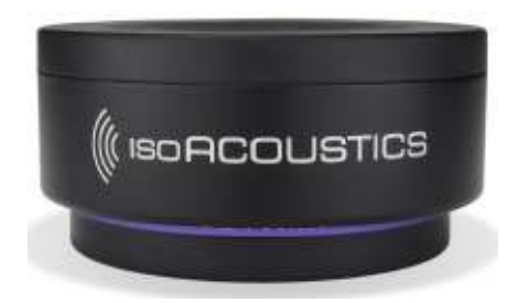
40 lbs each (Pack of 2)