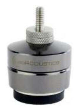
GAIA-II 120 lbs / Pack (Pack of 4)