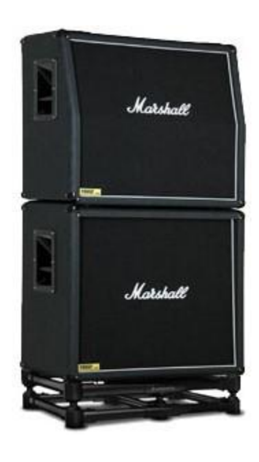
Isolation Stands For Guitar / Bass Amps