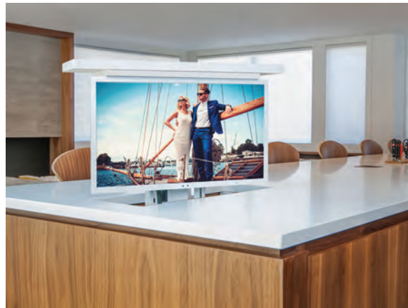
MODEL L-23s Pop-Up TV Lift with Manual Swivel