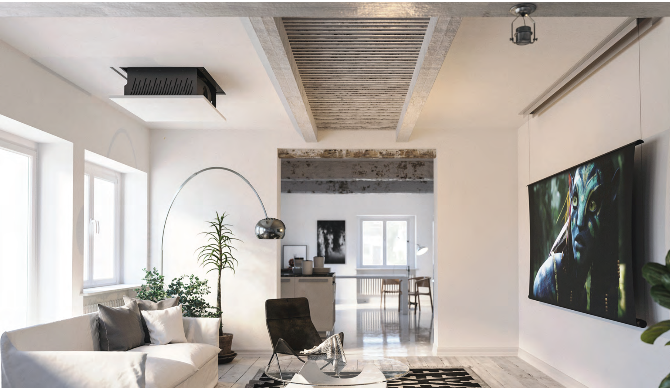
ECIPSE E-550 Projector Drop-Down Lift with Adjustable Mount