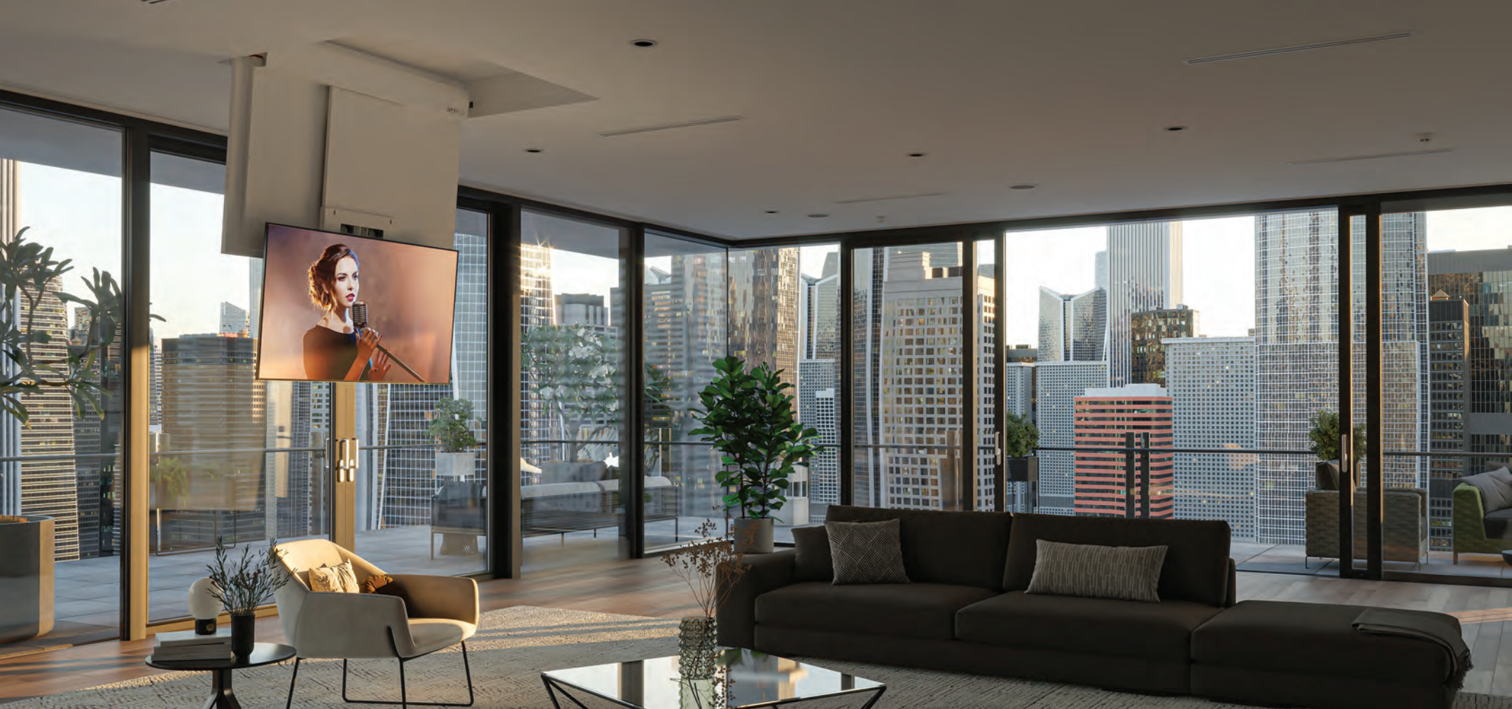
MODEL CL-65e Ceiling Flip-Down + Extend TV Lift