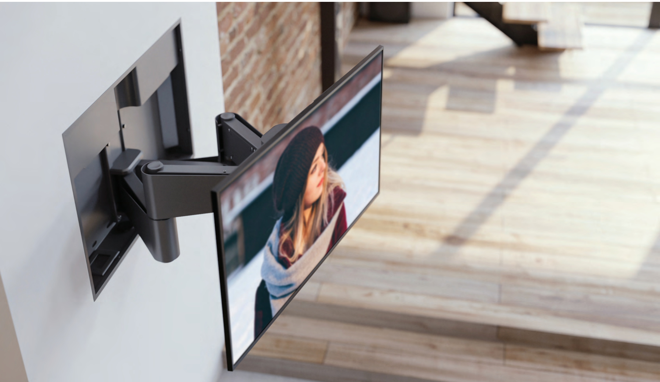
APEX Extend + Swivel Motorized TV Wall Mount