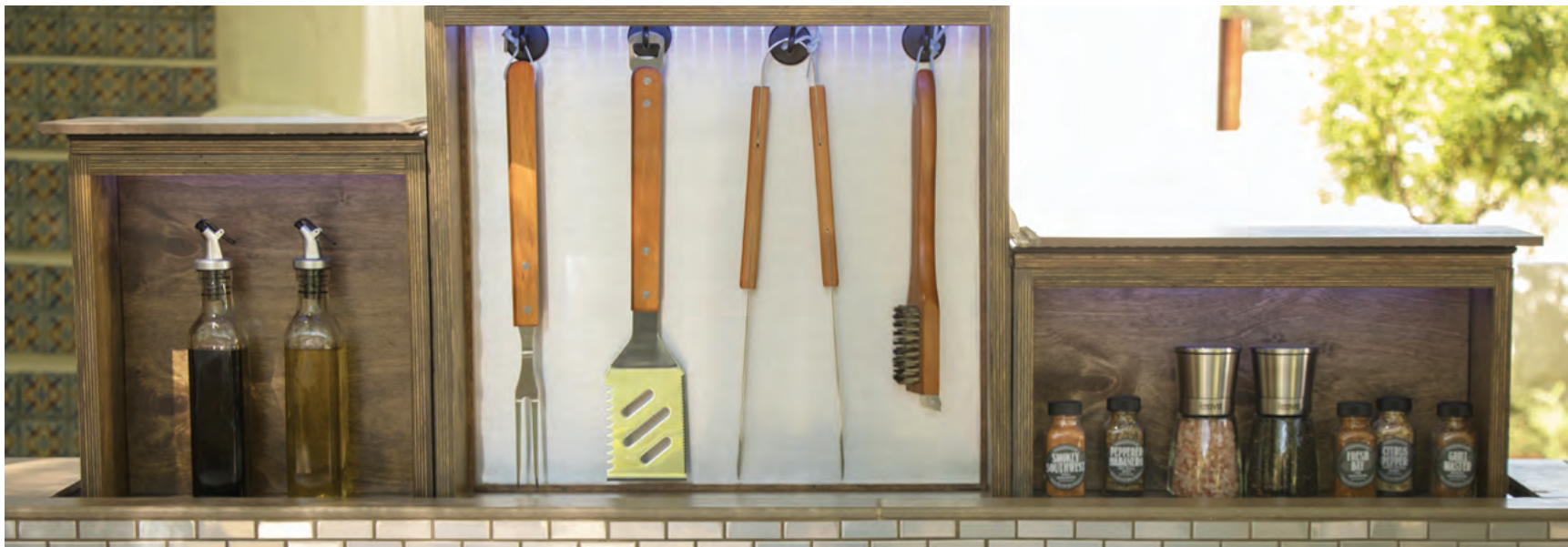
MODEL AL-250 Hidden Storage / Kitchen Appliance Lift