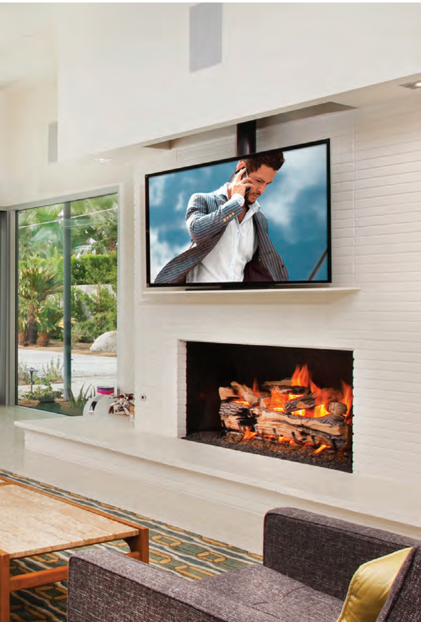
MODEL L77i Ceiling Drop-Down TV Lift