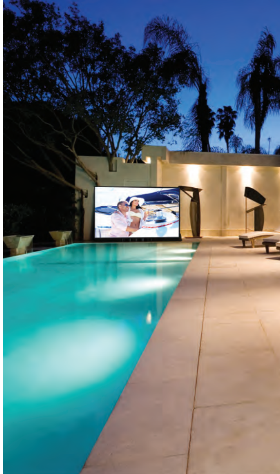
MODEL XL-85 Extended Travel Pop-Up TV Lift