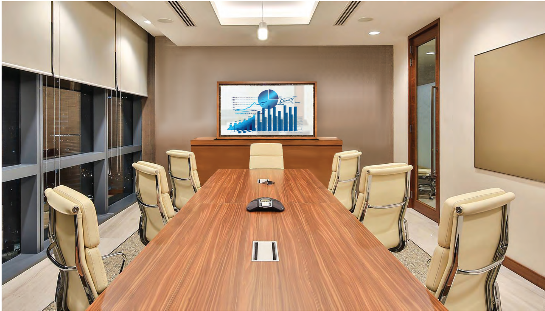
MODEL DL-65en Heavyweight Dual Column Pop-Up Enclosure TV Lift

From office desks to restaurants, concealing and revealing screens, projectors and other components allows for endless design possibilities in commercial spaces.