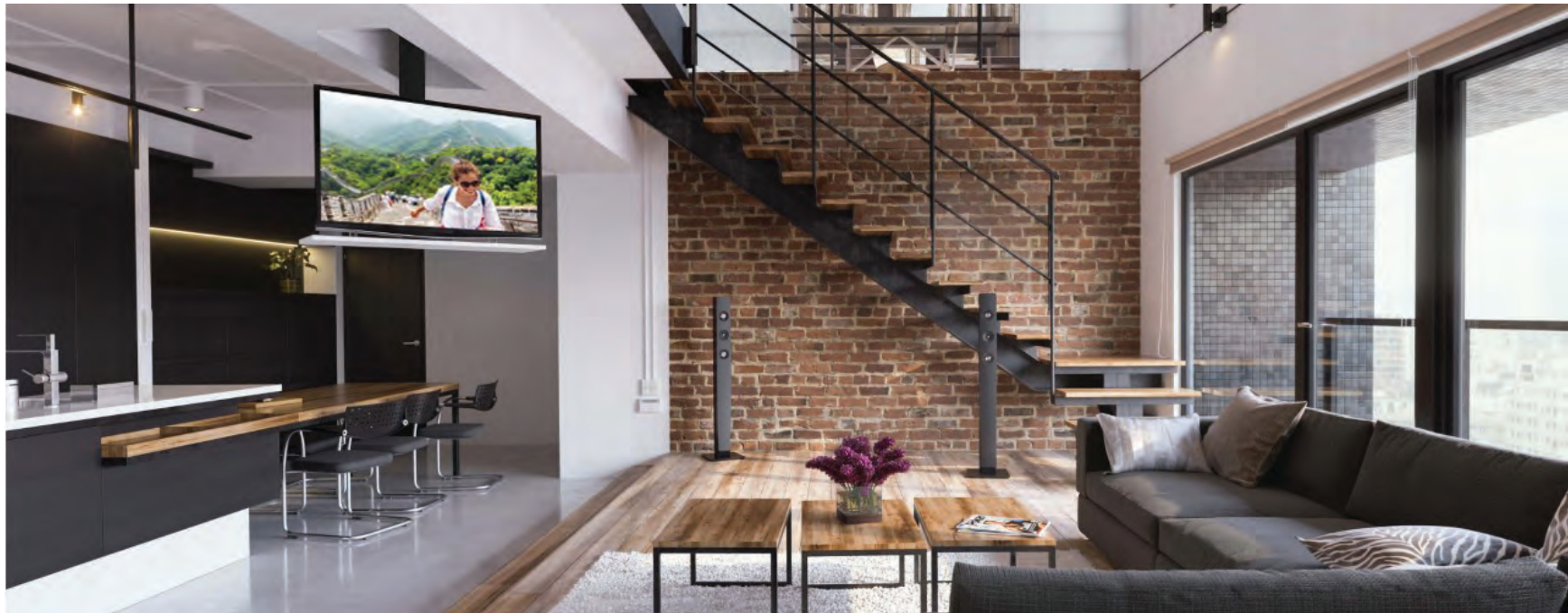
MODEL L-77ix Ceiling Drop-Down TV Lift with Motorized Swivel

Technology can emerge from anywhere in the home—including the ceiling. Whether you need to preserve an incredible view, or simply prefer the minimalist aesthetic, the possibilities are endless with drop-down and flip-down TV lifts.