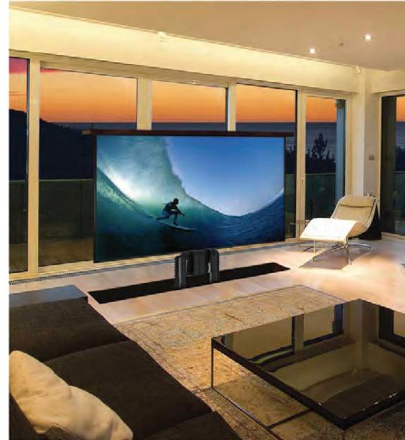
MODEL XL-85 Extended Travel Pop-Up TV Lift