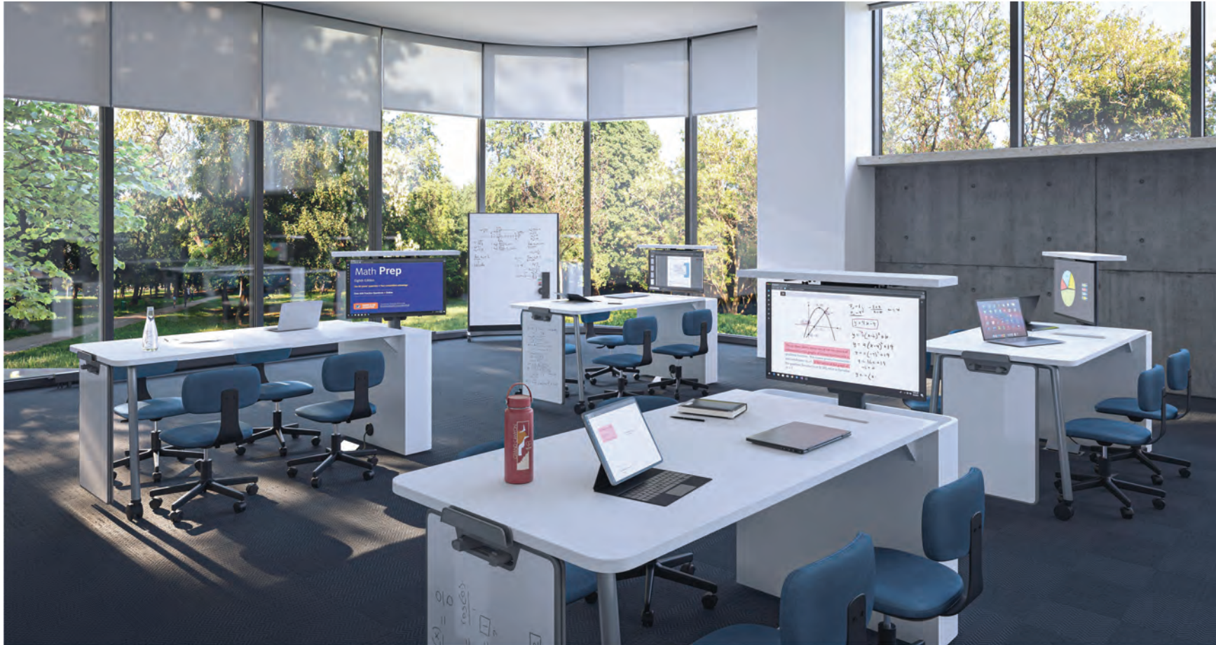
MODEL L-27's Pop-Up TV Lift with Manual Swivel