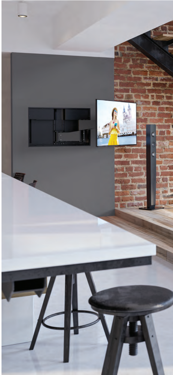
APEX Extend + Swivel Motorized TV Wall Mount