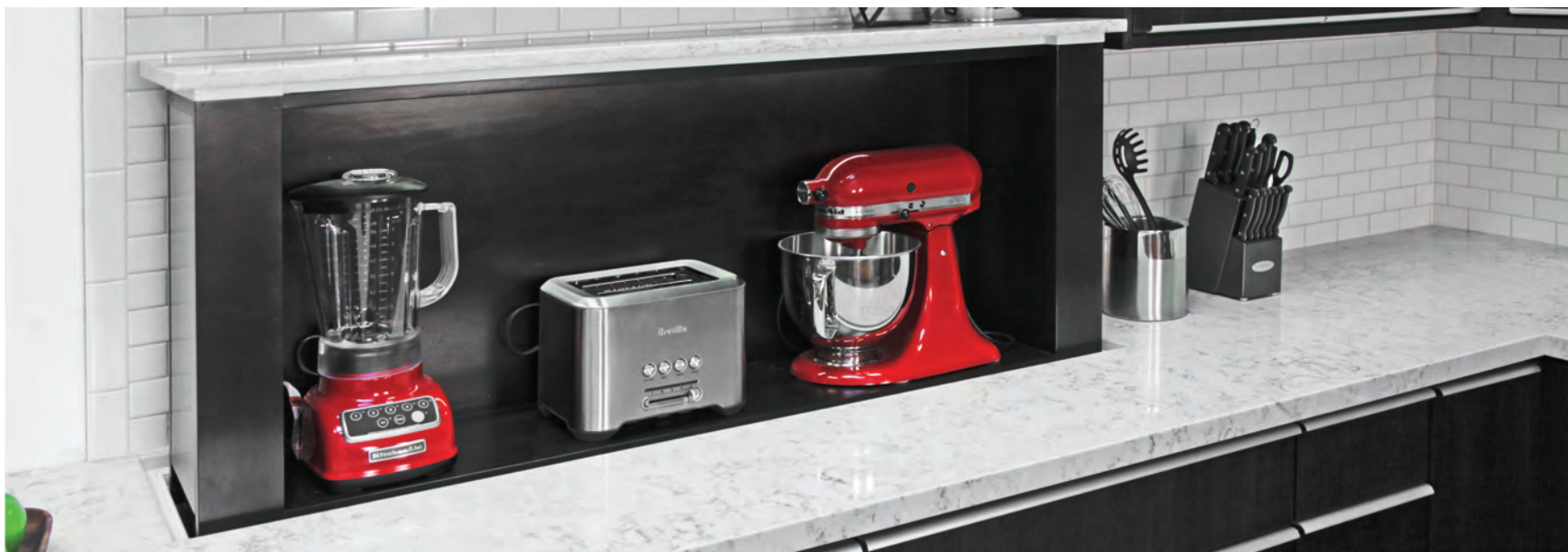
MODEL AL-250 Hidden Storage / Kitchen Appliance Lift