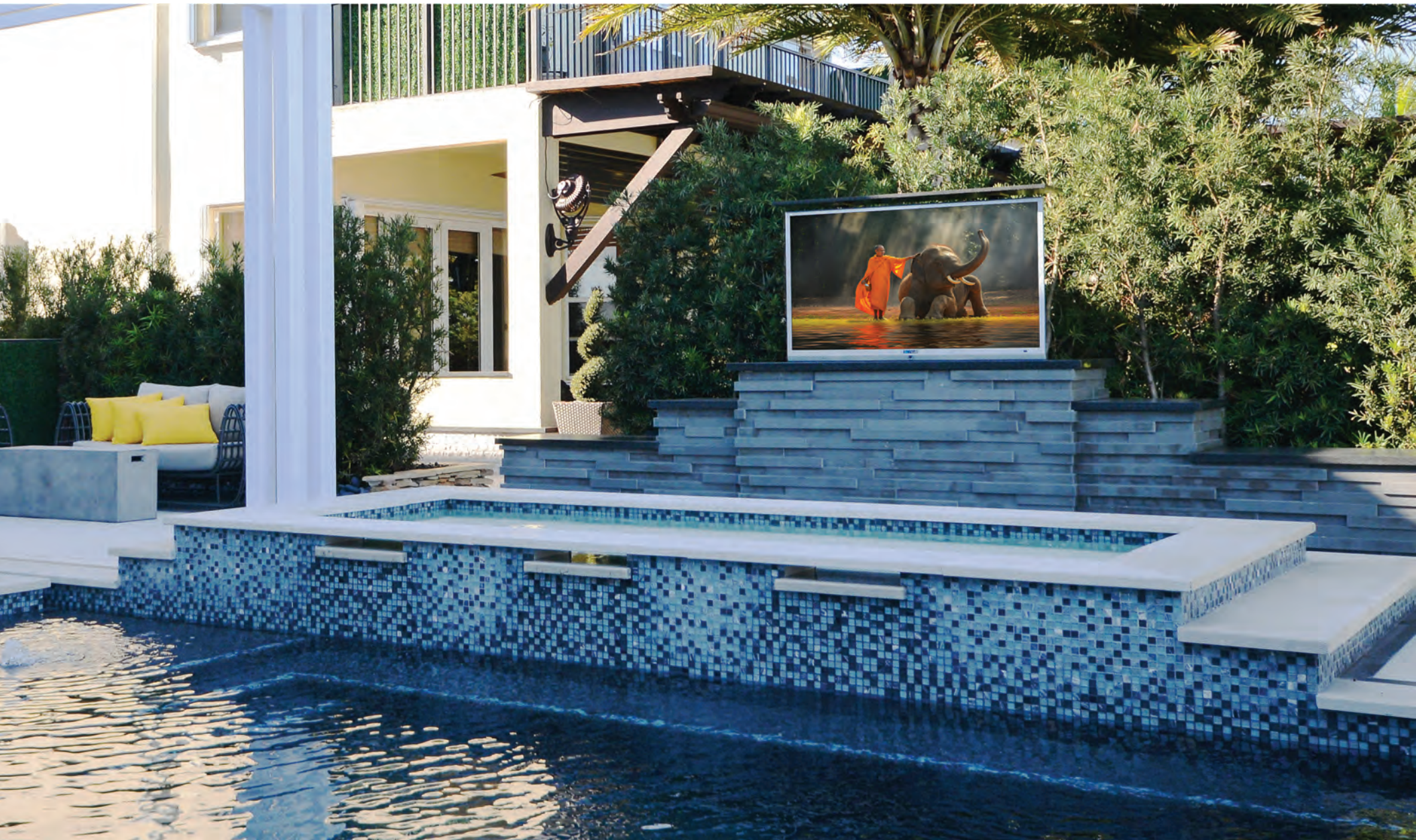
MODEL XL-85 Extended Travel Pop-Up TV Lift