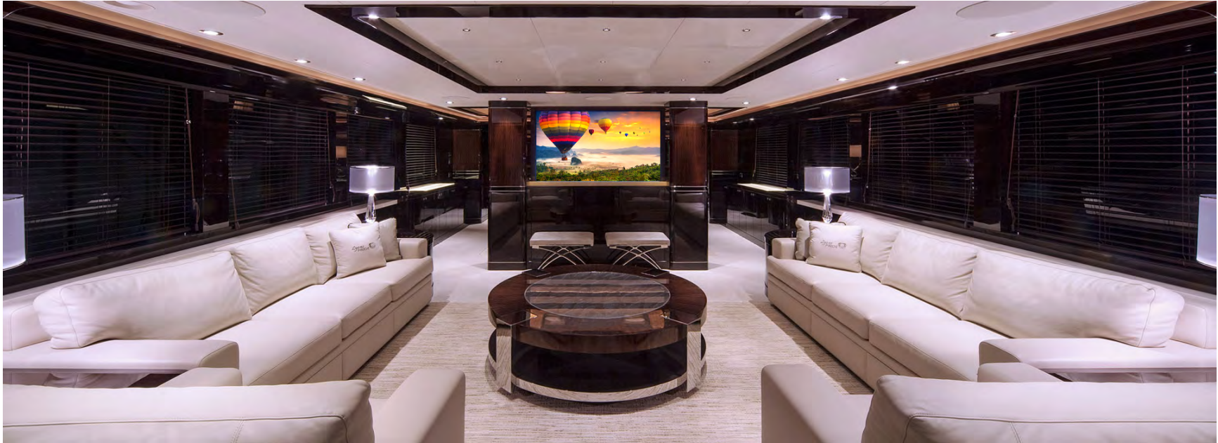
MODEL ML-65 Heavyweight Pop-Up TV Lift for Mobile Applications