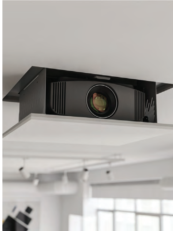
ECLIPSE E-550 Projector Drop-Down Lift with Adjustable Mount