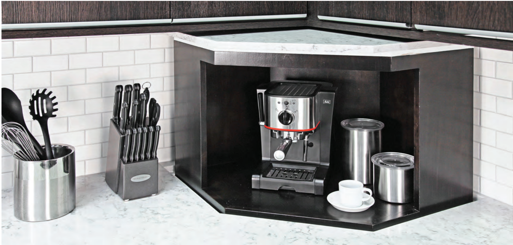
MODEL AL-125 Hidden Storage / Kitchen Appliance Lift

Reclaim dead space with a Nexus 21 hidden storage lift. Conceal coffee stations or other appliances, hide valuables, create more storage space, or reveal a show-stopping hidden bar. The possibilities are endless.