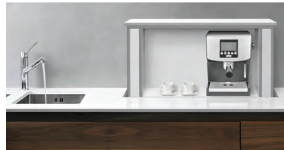
MODEL AL-250 Hidden Storage / Kitchen Appliance Lift