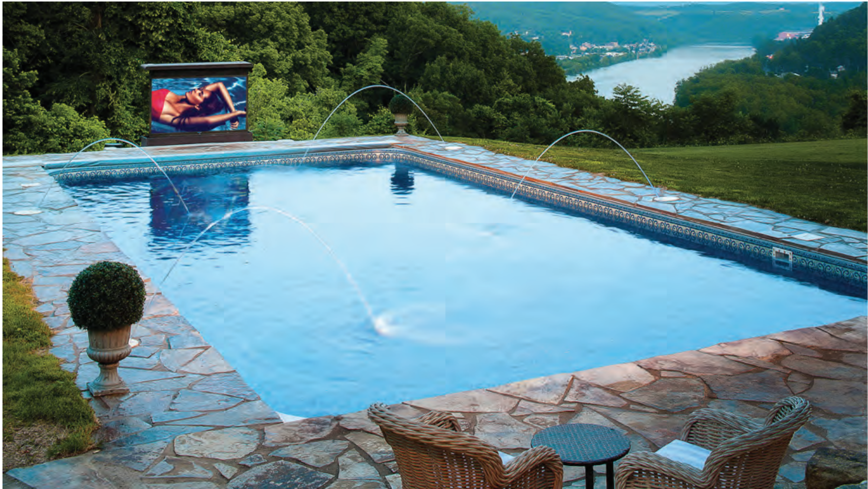
MODEL L-90 Pop-Up TV Lift