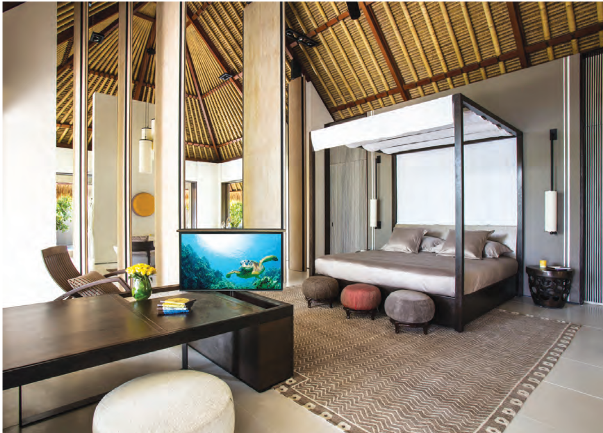
MODEL L-27's Pop-Up TV Lift with Manual Swivel