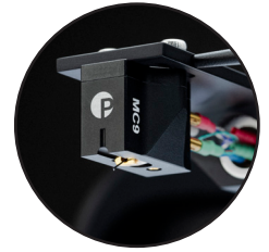
Full aluminium body