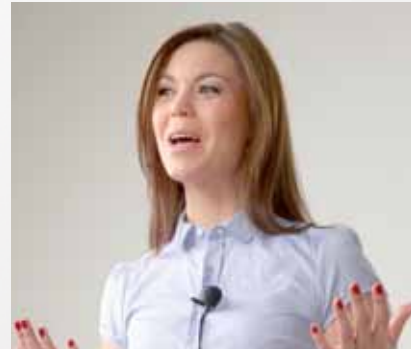
Clip-on microphone Discreet, comfortable to wear