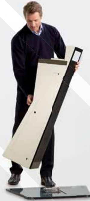
Set up in no time