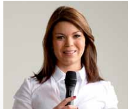
Hand-held microphone: Universal use, easy handling