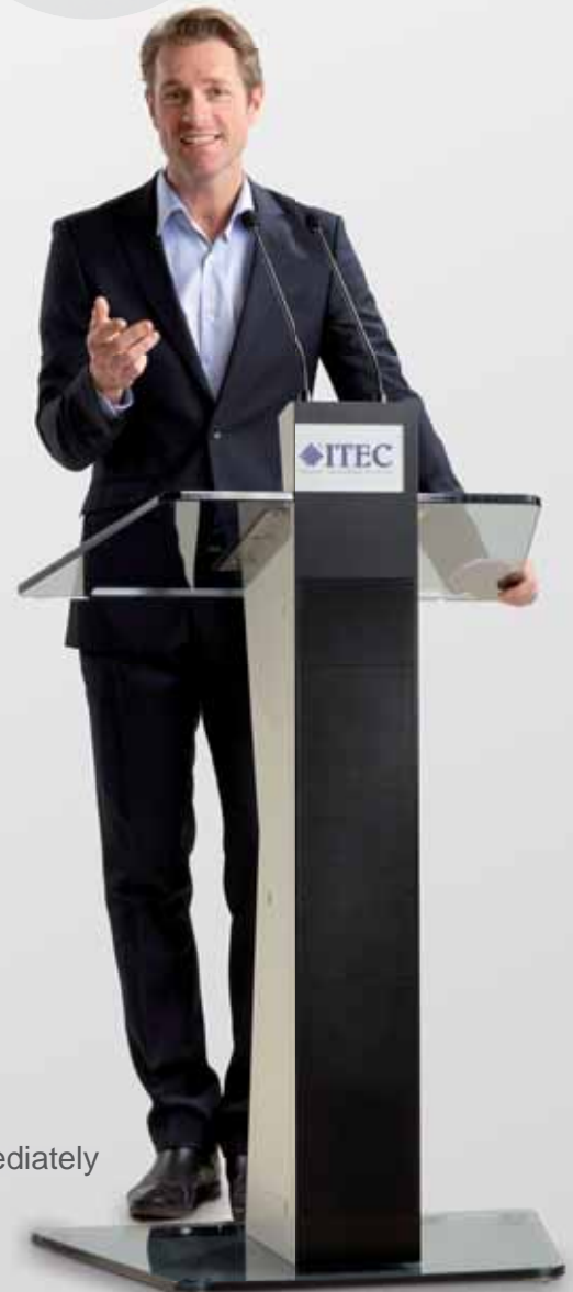
Ready to use immediately