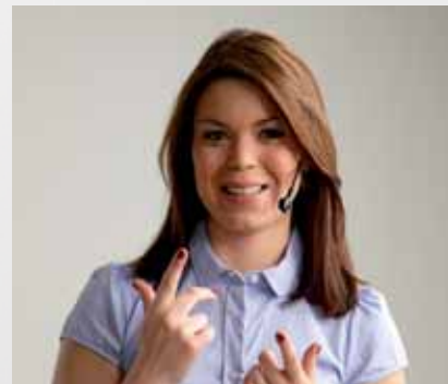
Headset: The professional solution for top clarity